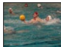
Boys' Water Polo see p. 16