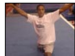
Boys' Gymnastics see p. 18