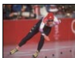
2006 Olympics see p. 17