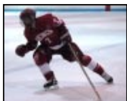
Hockey see p. 16