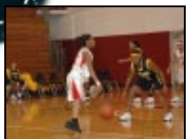
Girls' Basketball See p. 16