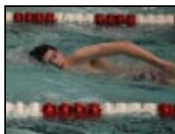
Boys' Swimming See p. 17