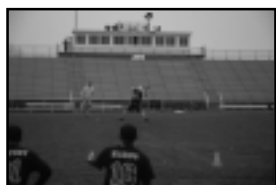
Intramural Football See p. 16