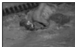
Girls' Swimming See p. 17